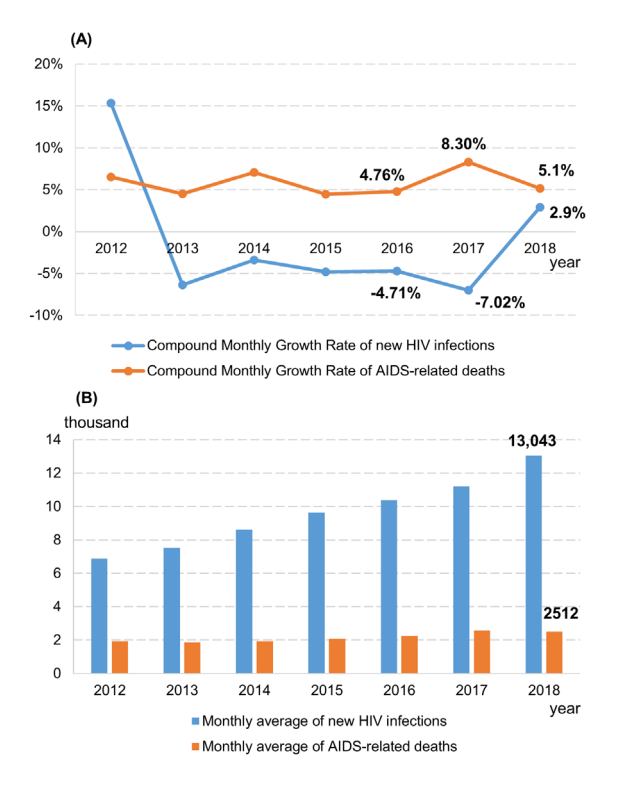
Figure 3. HIV/AIDS epidemic in China monthly from 2012 to 2018. There was a sudden increase in new HIV infections in China from January 2018, showing compound monthly growth rate (CMGR) of 2018 increased by 9.92% compared to 2017.

MSM . HIV prevalence among MSM has been rising in China in this day and age. The data from the 5th National Conference on HIV/AIDS showed the average prevalence of HIV infection to be 7.3% in the MSM group (10). It is clear that the HIV epidemic among men